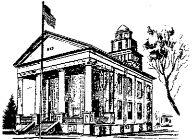
MICHIGAN'S OLDEST COURTHOUSE