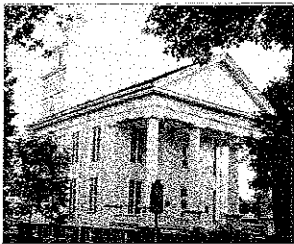
MICHIGAN'S OLDEST COURTHOUSE