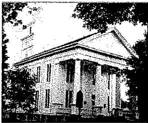
MICHIGAN'S OLDEST COURTHOUSE