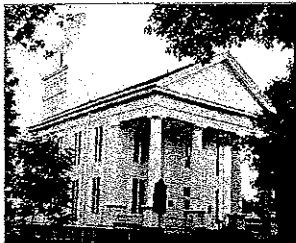
MICHIGAN'S OLDEST COURTHOUSE