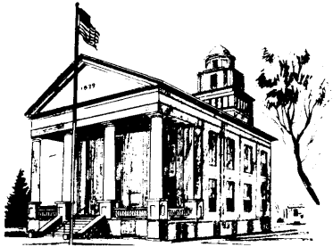
MICHIGAN'S OLDEST COURTHOUSE