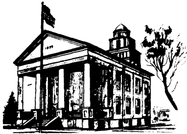
MICHIGAN'S OLDEST COURTHOUSE