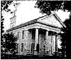
MICHIGAN'S OLDEST COURTHOUSE