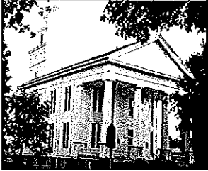
MICHIGAN'S OLDEST COURTHOUSE