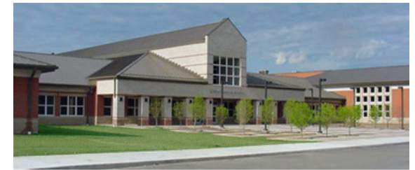
Almont Middle School